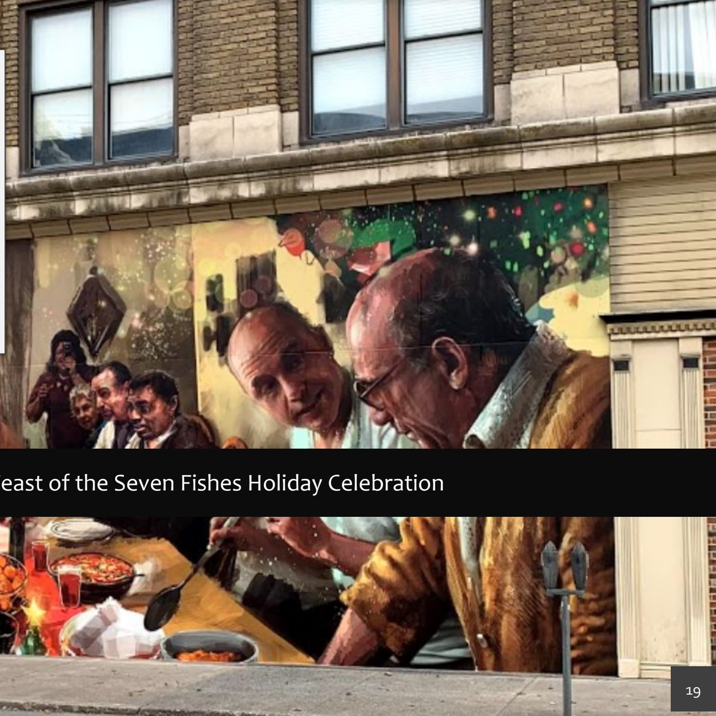
2021 Feast of the Seven Fishes Holiday Celebration